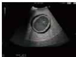
brain (transparent septum)