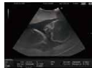
estimate the fetal weight