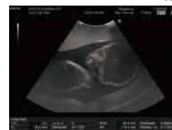
estimate the fetal weight