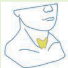
No.2 Hashimoto's Disease