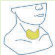
No.1 Graves' Disease

Individual models of different pathologies (proposed)