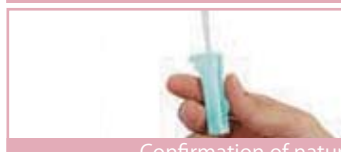
Confirmation of natural instillation