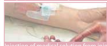
Injection of medical solution from injection sub port