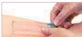
Puncture with IV cannula