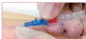
Confirmation of flash back in puncture