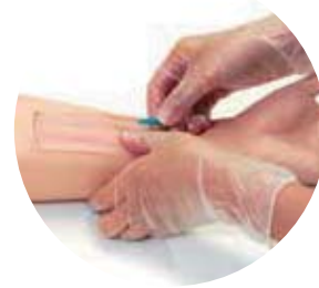
median antebrachial vein