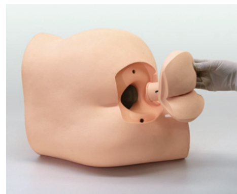
4 interchangeable rectum units for differentiation of lesion types.