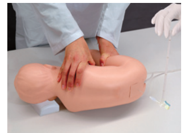
CSF Pressure Measurement