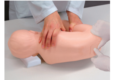
Palpation of Landmarks