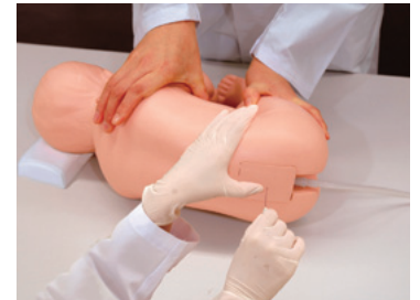
Lumbar Puncture and CSF Collection