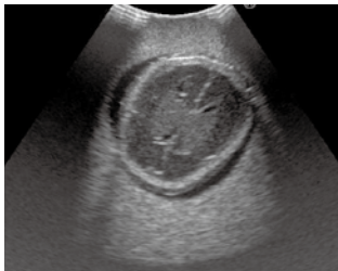
Brain with septum lucidum and lateral ventricles.