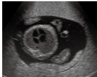
Heart with four chambers