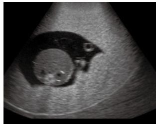
Evaluation of amniotic fluid volume