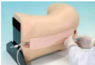
Lumbar puncture (CSF collection)