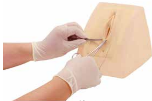
* Suturing instruments are not included.