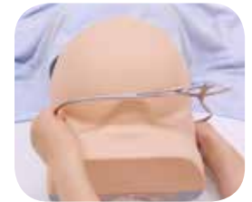
External oblique diameter

* Measuring instruments are not included.