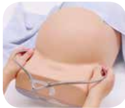
Distantia spinarum (distance measured between iliac spines)