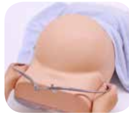
Distantia cristarum (distance measured between the prominent points of iliac bones)