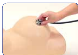
Auscultation with a conventional stethoscope