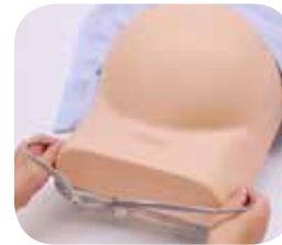
Distantia trochanterica (distance between the prominent parts of trochanter major)