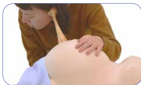
Auscultation with a Pinard stethoscope

Sounds recorded by Doppler and conventional stethoscope are prepared for training. Sounds are controlled wirelessly by the remote control, including selection of sounds, volume and heart rate setting as well as switching between internal and external speakers.