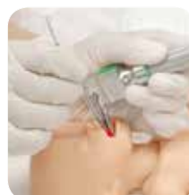
Endotracheal intubation (confirmation of unilateral/bilateral ventilation)