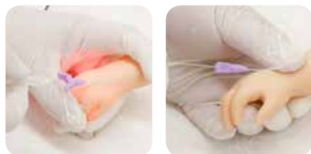
PI catheter insertion (vein localization using a transilluminator is possible)

NCPR Simulator Plus facilitates training of a variety of clinical skills required in NICU. The simulator is also suitable for the neonatal CPR training course.