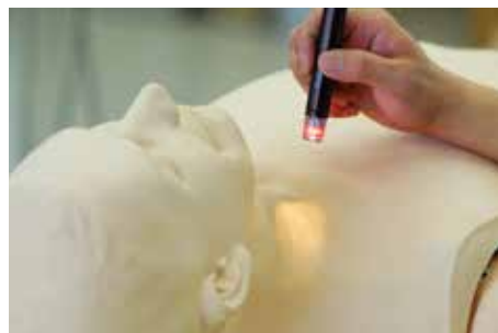
Observation of jugular veins * Penlight is not included.