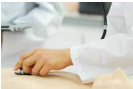
Auscultation of heart sounds