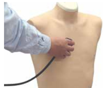
Auscultation of lung sounds * Stethoscope is not included.