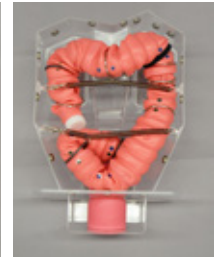
Long alpha loop