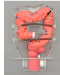
Short alpha loop