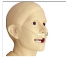
Oxygen/nasal cannula placement