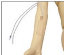
IV insertion and care