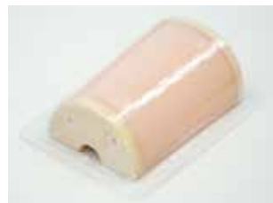
Disposable ultrasound puncture pad