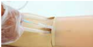
Guide wire insertion