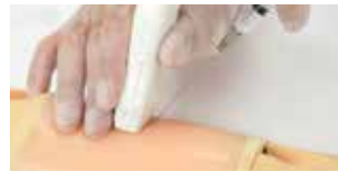
Ultrasound guided puncture