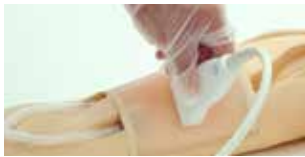
Puncture site selection

Anatomically correct bifurcation of the vein provides realistic resistance on its outer walls and simulates complications such as catheter malpositioning.