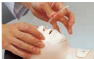
Airway Suction (Nasal)