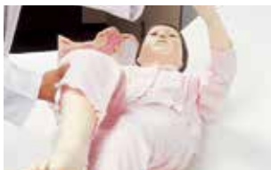
Positioning, Patient Handling