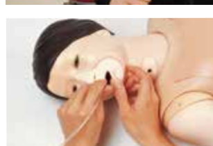
Airway Suction (Oral)