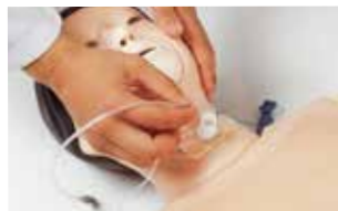
Airway Suction (Tracheostomy)