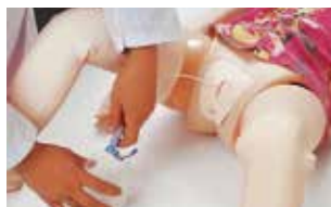
Male &amp; Female Catheterization