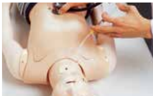
Feeding Tube Management